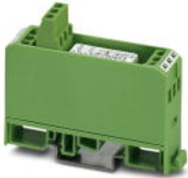
Relay module, with soldered-in miniature switching relay, contact (AgNi+Au): Small to large loads, 2 PDT, 24 V AC/DC input voltage

Please be informed that the data shown in this PDF Document is generated from our Online Catalog. Please find the complete data in the user's documentation. Our General Terms of Use for Downloads are valid ( http://phoenixcontact.com/download )