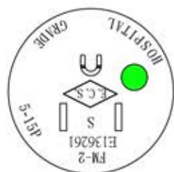
插頭端面圖 (Dimensions of Plug Face)

Insulation Thickness 0.76 mm Overall Diameter 2.70±0.10 mm