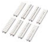
Zack marker strip, Can be ordered: Strip, white, Labeled according to customer specifications, Mounting type: Snap into tall marker groove, For terminal block width: 5.2 mm, Lettering field: 5.15 x 10.5 mm