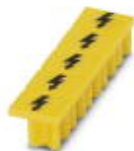
Warning cover, 5-pos., for terminal width: 5.2 mm