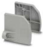
Flange cover, Color: gray