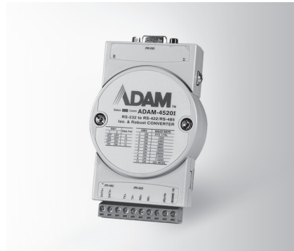
ADAM-4520I FCC CE RoHS UL US