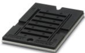
The figure shows version

Magazine for the THERMOMARK PRIME printer, for accommodating UCT-WMTBA (25x6), UCT-WMTBA (29x6), UCT-WMTBA (40x17)